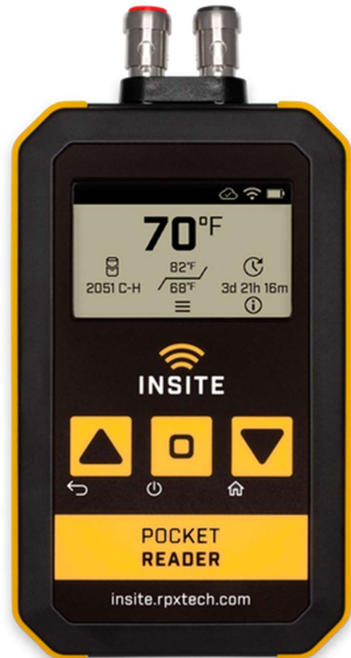
InSite Cloud Software on Wireless Device

The Pocket Reader can start loggers and can be used to spot-check the logger's current status. It can be used to view the loggers battery voltage, runtime, and firmware version. In short it can be used as your primary method of accessing, uploading and monitoring concrete data. A Pocket Reader and Loggers are all you need to start monitoring temperatures and determining concrete strengths!