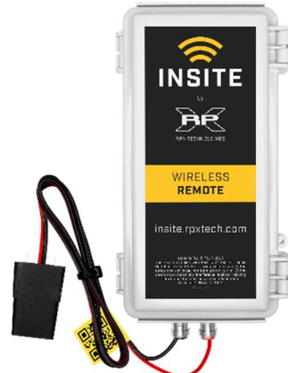
Self-Starting, 1-minute, 180-day Insite Concrete Logger connected to Wireless Remote

InSite loggers are wired to increase reliability and to reduce the per-test cost to your project